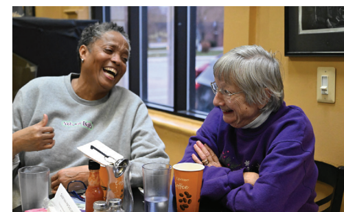
Dec. 2: Central Conference event

Check out these photos from our synod-wide storytelling event series! And stay tuned for more events (which are open to all) to be announced in the coming weeks.