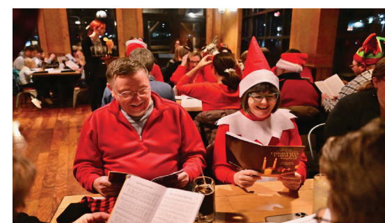
Dec. 12: North Conference event